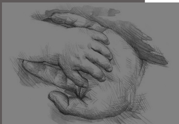
Fathers and Children, Hand in Hand

Saturday, June 18th 11am - 3pm Garfield Park - Decatur, IL